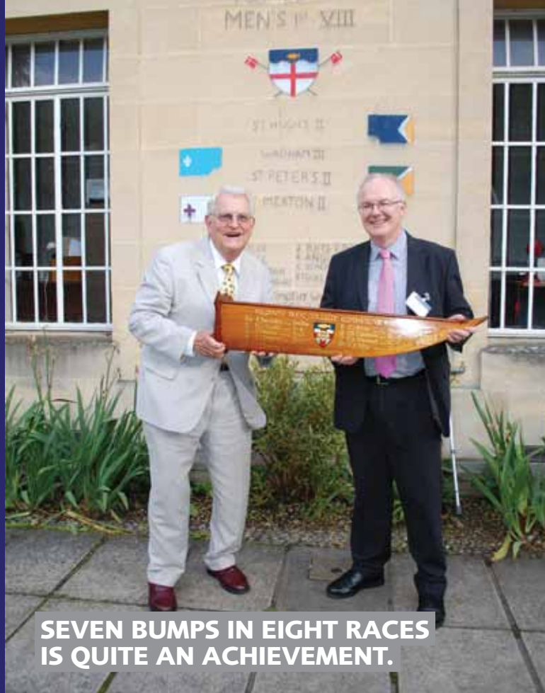
SEVEN BUMPS IN EIGHT RACES IS QUITE AN ACHIEVEMENT.