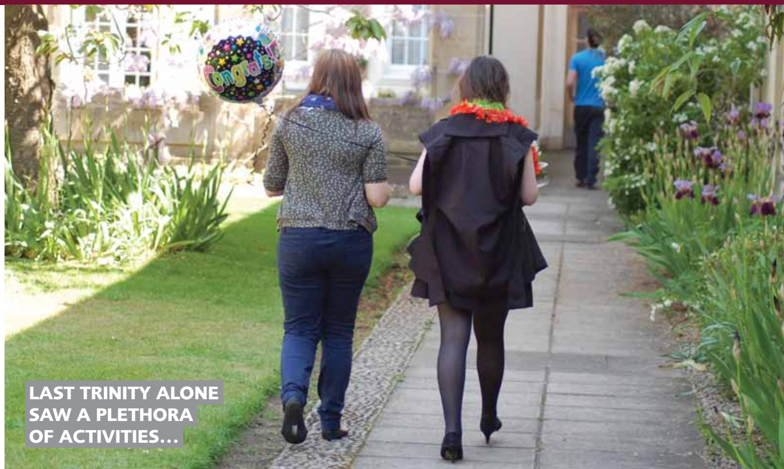
LAST TRINITY ALONE SAW A PLETHORA OF ACTIVITIES...

In addition to this, the termly Charity Lunch put on by the kitchen staff, as well as the generous regular chapel collections, helped to boost Regent's fundraising totals. This year, the JCR chose to support three charities, which are doing tremendous work in Oxford and beyond. The first of these was Jacari, a student-run charity providing home tutoring in Oxford for children aged 4–16 who don't speak English as their first language. As well as donating money to Jacari from events such as this, many Regent's students have been involved in tutoring the children. Secondly, students chose to support the Global Chalkboard Project, an educational charity that enables children to help children by creating sister-school connections between schools in the USA and UK and schools in crisis-hit areas. The organisation's current project is working towards aiding the Mixte Victor Hugo School in Haiti, close to the