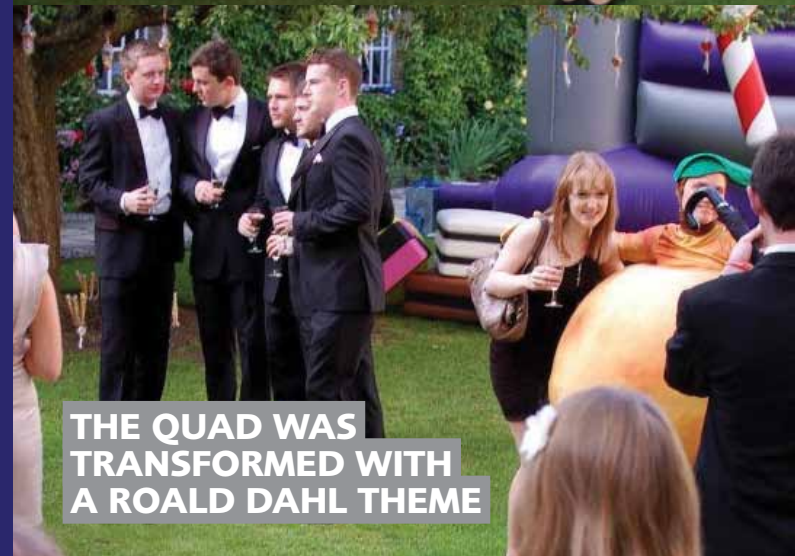
THE QUAD WAS TRANSFORMED WITH A ROALD DAHL THEME