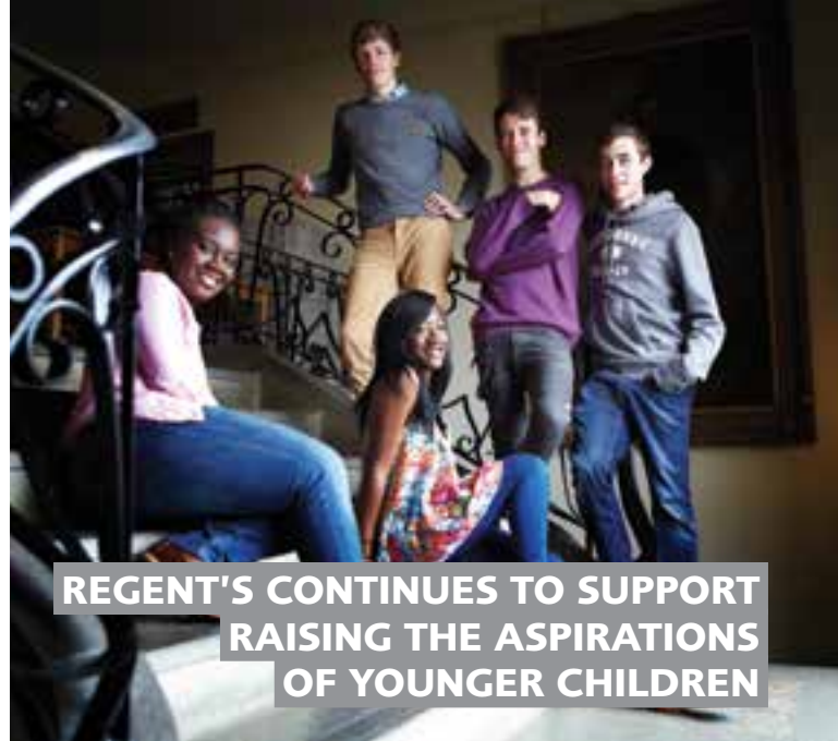
REGENT'S CONTINUES TO SUPPORT RAISING THE ASPIRATIONS OF YOUNGER CHILDREN

Regent's continues to support raising the aspirations of younger children and has welcomed groups from IntoUniversity (Year 6) and Mount Grace School, Potters Bar (Yr 9) into College this year.