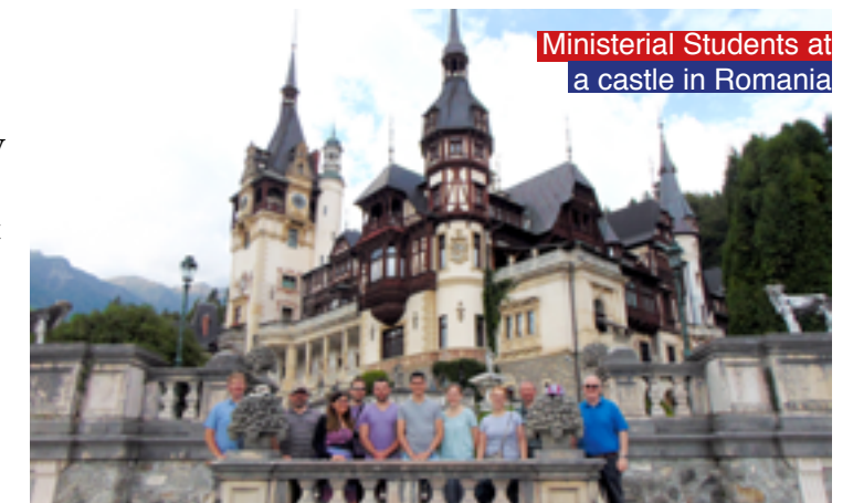
Ministerial Students at a castle in Romania

As always, we had a bittersweet end to the year as we said goodbye to all those who had completed their time at Regent's. By the end of Trinity Term the majority had settled-in to churches and they go with our love and prayers into the next stage of their ministries.