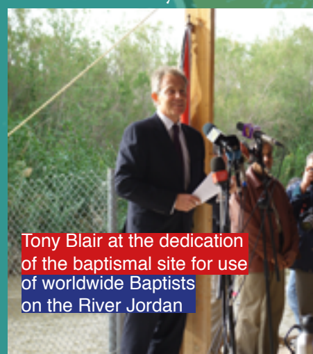
Tony Blair at the dedication of the baptismal site for use of worldwide Baptists on the River Jordan

The onward movement of the so-called 'Islamic State', causing massive human suffering and devastation, is constantly in the news at the moment. There is also the constant danger of other forms of terrorism which make illegitimate appeals to religion. It is in this context that the establishing of a new post for the study of love in religion at Regent's Park College may make its contribution to peace and co-existence in the world. This, at least, is the hope of those who are funding the post, who are Muslim believers in Jordan. They have a daring vision, shared with us in Regent's, that placing the study of love in the academic context of a University will influence the minds and hearts of young people who come to study there.