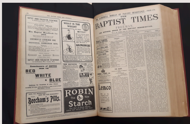
The Baptist Times 1905

In exciting news for 2025, digitisation of the Baptist Union Handbooks covering the years from 1832 to 1955 and the volumes of the Freeman/Baptist Times for the period 1855-2011 is now nearing completion and we hope to have them available online at Find My past and the British Newspaper Archive very soon. This will mean that you'll be able to access the rich sources of information contained within the handbooks and the Times for a small charge from the comfort of your own home. The date will be announced on our social media pages and we hope it will encourage even more research of Baptist and nonconformist history.