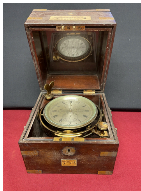
Grenfell's Marine Chronometer

On opening the 19th century 2-day Marine Chronometer belonging to George Grenfell, aforementioned missionary, geographer and explorer recently, we were amazed to find the mechanism, still working, ticking away keeping accurate time, as good as new! This ingenious piece of equipment would have allowed Grenfell to measure time at a fixed location in order to calculate the difference from his ships position, thus enabling accurate navigation. Grenfell's chronometer is housed in a beautiful wooden box, complete with brass plates and a tiny key. A Chronometer Rate card contained within confirms that it was "gaining five tenths" as of the 18th of July, 1911, 5 years after Grenfell's death in 1906. What a beautiful piece of machinery still working after well over a century!