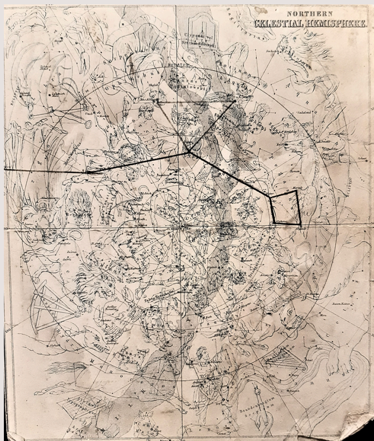
Picture of Northern Celestial chart used by Grenfell